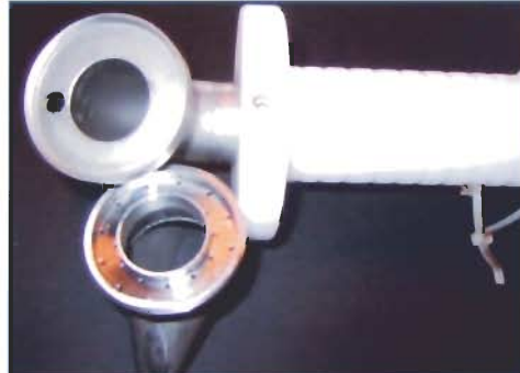
Photos of a new type of handle specially manufactured by Infood AB for Jarvis' Model CV-1 Steam Vacuum System.