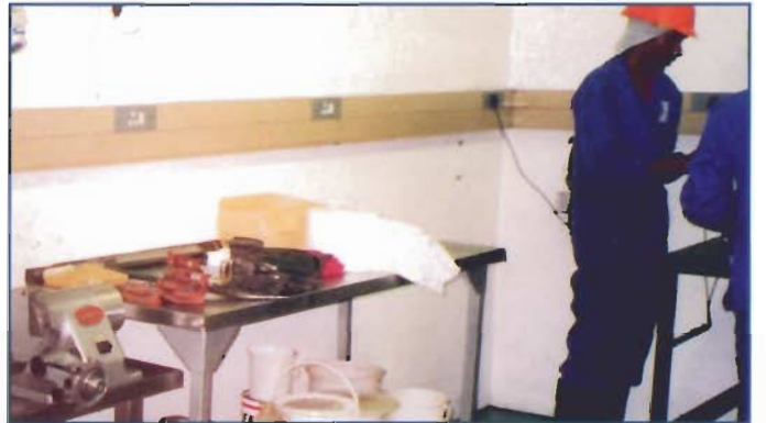
Picture taken in Karan Beef's modern processing facility. Note Jarvis' Model BR-5 Dehider Blade Reconditioner on the small corner table.