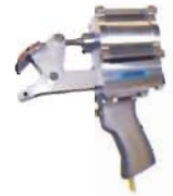
Model PFC-1 Picking Finger Cutter.