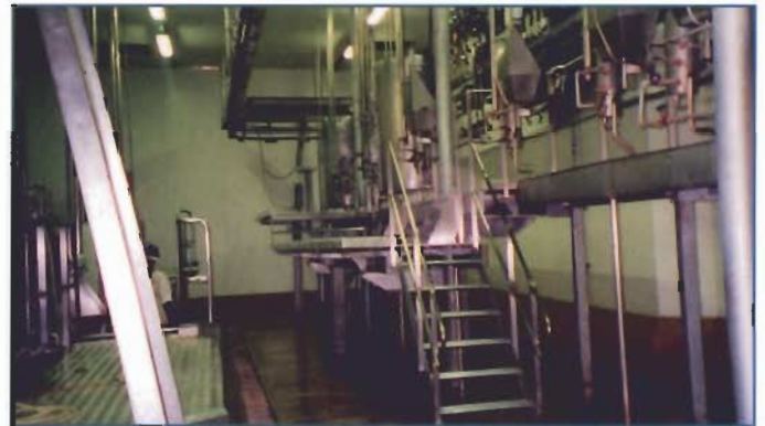
Pictures of the Karan Beef Company's interior. Renowned for its efficiency, Karan Beef's Balfour plant is one of South Africa's most modern processing facilities.