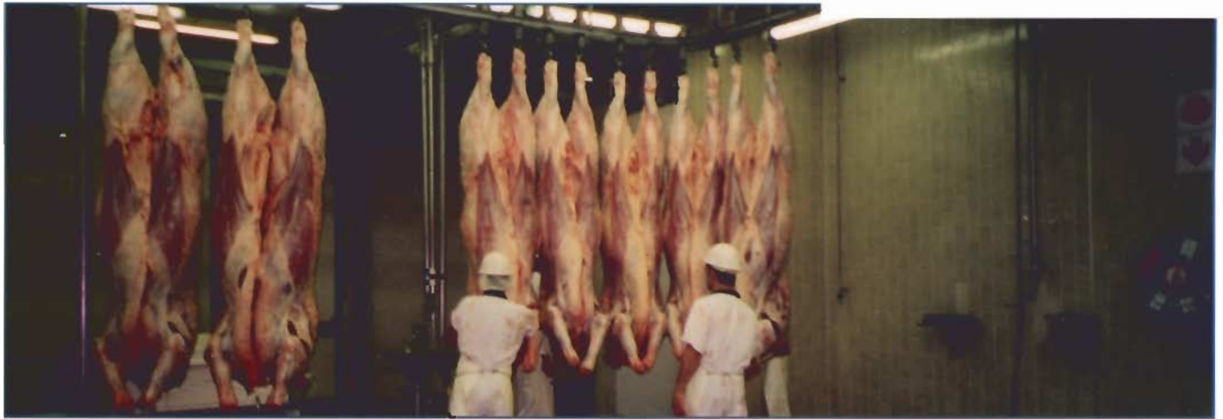
Picture of Karan Beef Company's ultra-modern kill floor.