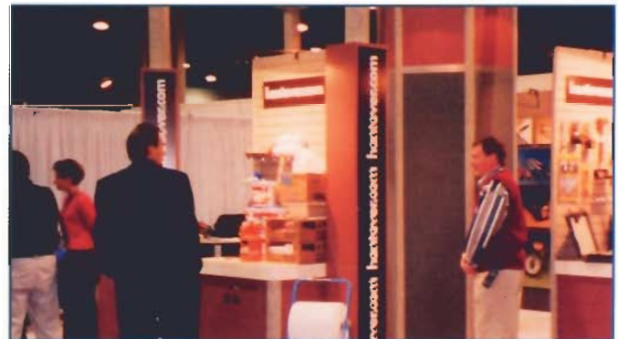
Photograph of the Hantover Corporation booth. Hantover Corporation supplies in addition to meat packing equipment, industrial personal protection items, medical and first aid supplies, material handling equipment, clean up and maintenance goods.